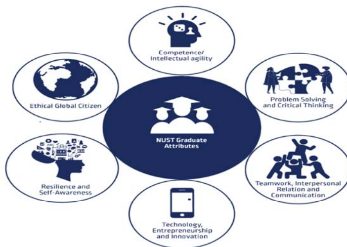
Figure 1: NUST Graduate Attributes

NUST aims to produce graduates characterised not only by critical thinking, technical and literary competence but also committed to lifelong learning and global citizenship and well prepared for the 21st century and the demands of the 4IR. The university expects all its graduates to possess at the level appropriate to the qualification being awarded, the following graduate attributes ( Refer to Figure 1 ):