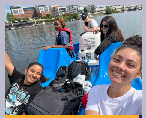
An outing organised by the international students coordinators for a number of other exchange students to join, make new friends and see more of Germany.

A few days after my arrival in Germany I was so excited for my first class, ready to learn. After the first 10 minutes of sitting in a class with the lecturer teaching in German, I raised my hand to tell him I do not understand. In fact, all four of us exchange students from NUST could not understand a single word. Yes, he was unaware that we were in his class. but he refused to teach in English and said that the university's language of instruction was German. I sat there for the remaining 30 minutes of the lecture wondering what the next few classes would be like. And indeed, the rest of the day was not very different.