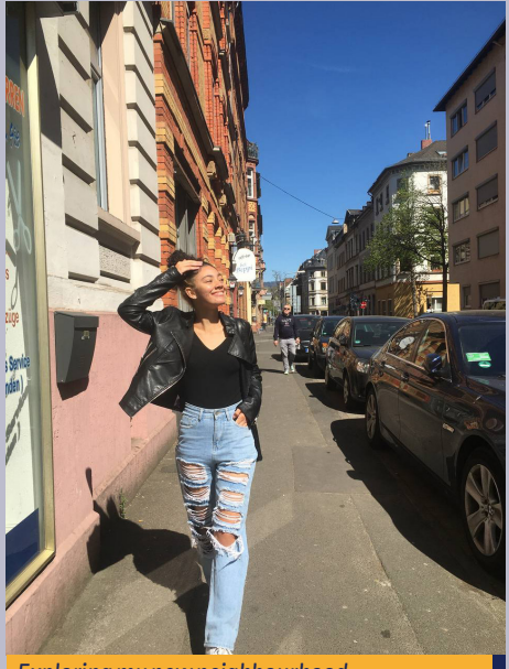
Exploring my new neighbourhood.

language a lot better now, and have the confidence to speak to people in public. I have a deeper understanding of German culture, the way of living and the German people. During this vear I have experienced so many different cultures, many that I never expected to be exposed to in Germany or in general. I have proven to myself that I can overcome any challenge and that I can succeed at any task . The sense of independence and selfassurance I have acquired from being alone and outside of my comfort zone is something I would've never gained had I stayed in Namibia. Not to mention my German getting this good. After all that has happened, I am happy to say I do not regret coming to live here.