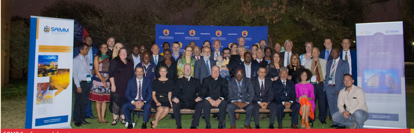
SOMP Conference delegates.

This year the SOMP Conference was held in hybrid format, with delegates attending the event virtually from