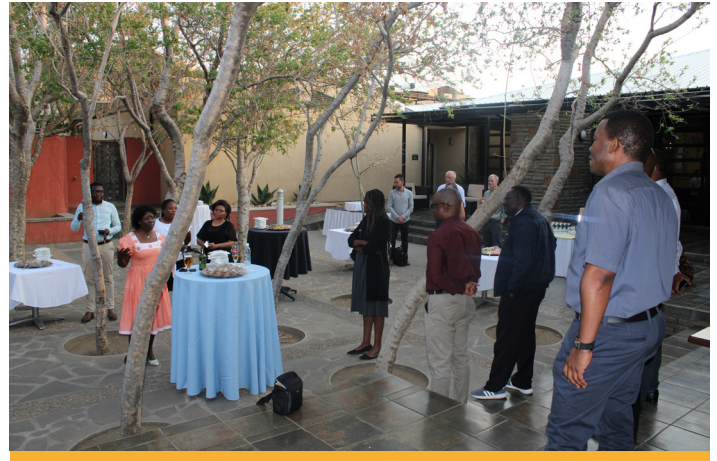
Department of International Relations hosted a networking event for all international academics and experts at NUST.

The "Study Abroad, Taste the World" initiative, which