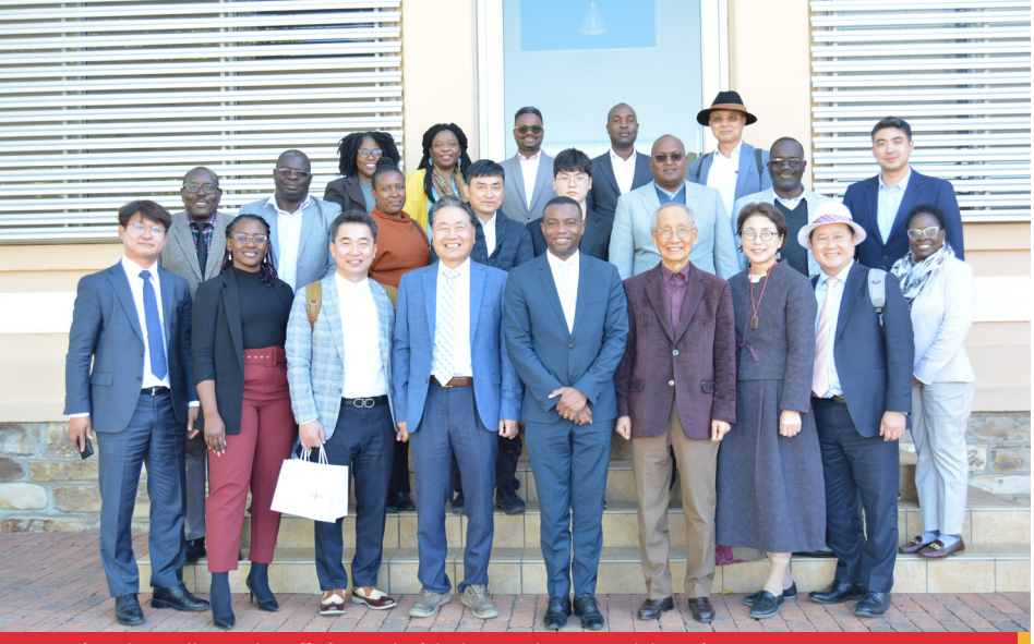
NUST Vice Chancellor and staff pictured with the South Korean delegation.

The discussion between NUST's management and the South Korean delegation centered on development of a the Health Tourism Curriculum for offer at the tertiary education level, setting up of Technology Parks in Namibia, collaboration in the field of Sport Management, and the potential hosting of a South Korean-Namibia Cultural Festival in the future.