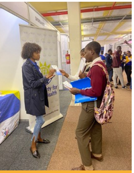
Education Officer sharing DAFI scholarship insight with learners from different schools.