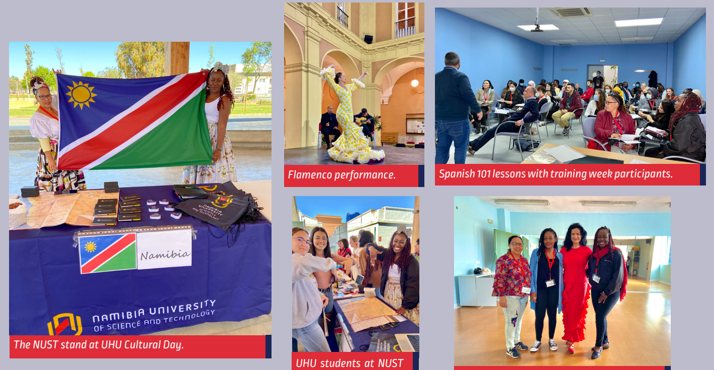
Dance classes at UHU Training Week 2022.

Overall, the week was successful and it strengthened the relationship between the two institutions.