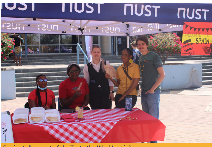
Spain stall as part of the Taste the World activity.

internationalisation of higher education, had achieved this objective as the IR Section had experienced an increase in student inquiries about study abroad and international exchange opportunities