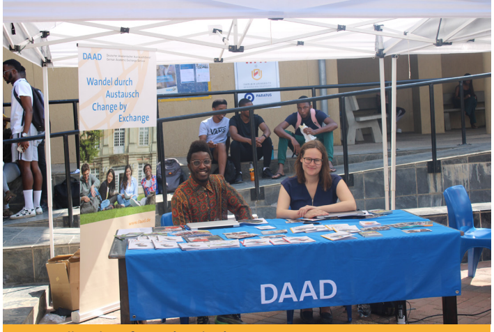
DAAD stall at the Information sharing event.

The IR Section also hosted an International Staff Networking Event on the evening of 08 September 2022 at the NUST Hotel School. This activity brought together international staff, visiting academics, guest lecturers and development partners as the IR Section sought to acknowledge those contributing to itnernationalisation of higher education at NUST and in Namibia.