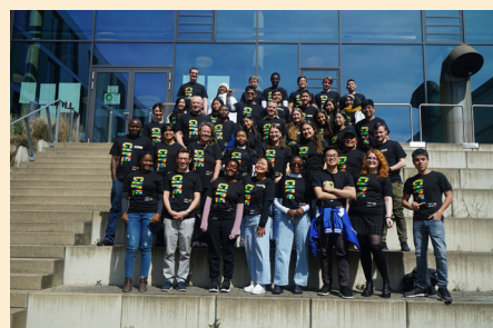
Top: NUST GIPE students pictured with NUST Vice-Chancellor. Bottom: All four university GIPE students in Germany.

The project stands as a testament to the remarkable collaboration between the four partner institutions (NUST, the Westphalia University of Applied Sciences, Universidad Católica San Pablo, and Atma Jaya Catholic University of Indonesia). From the outset in 2020, the coordinators and lecturers from the partner universities had to contend with the challenges posed by the COVID-19 pandemic. This initiative is also a shining example of the potential of project-based learning coupled with virtual collaboration across multiple time zones and involving participants from numerous cultures. The final project handover to the UNDP looms on the horizon and is slated for 24 July 2023.